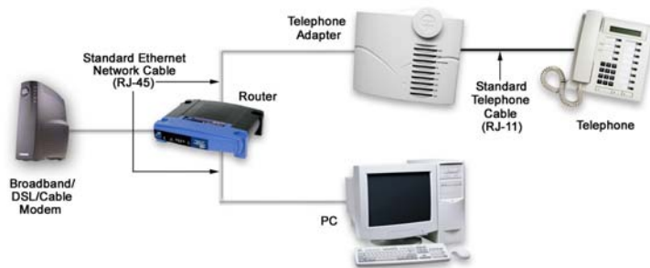
Figure 2: The InnoMedia MTA 3328-2 Configuration