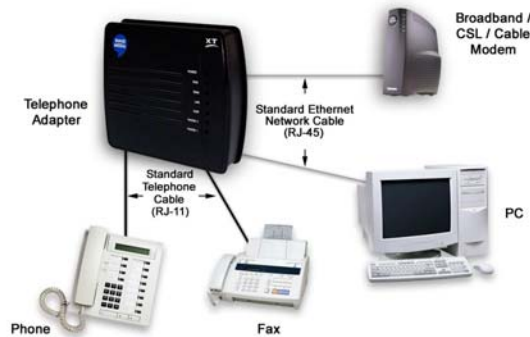
Figure 2: The MTA Configuration (For DHCP users with a single PC.)